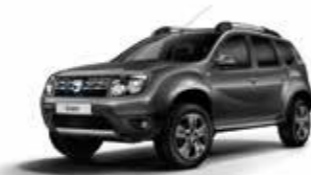
Slate Grey (KNA)