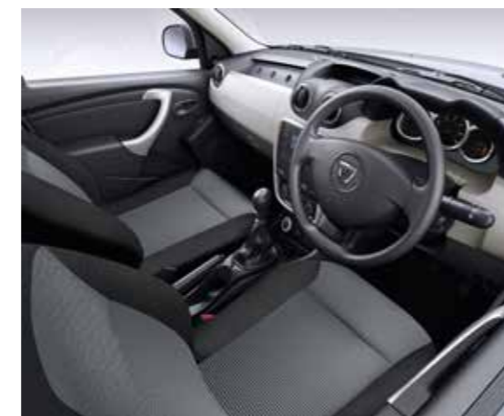
'Osmium' cloth upholstery