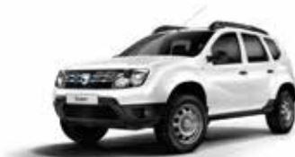
Glacier White (369)