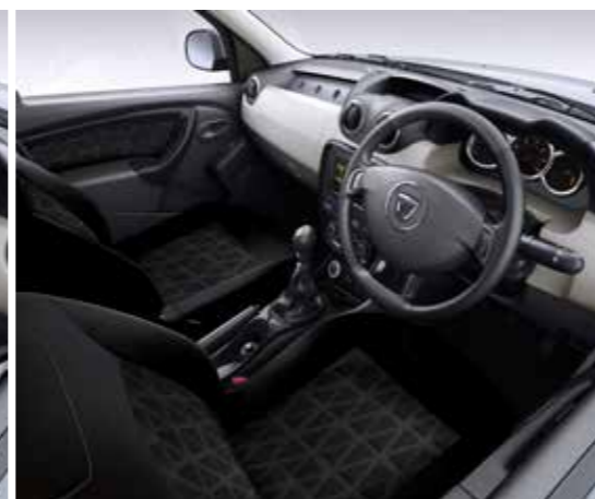
'Rhodium' cloth upholstery