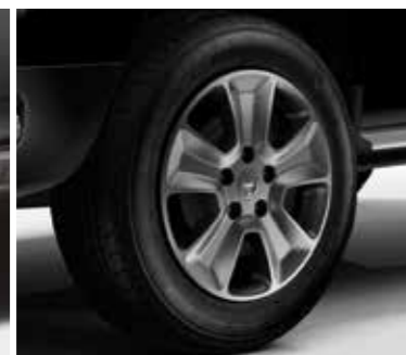
16" 'Tyrol' alloy wheels