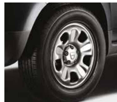
16" 'Matterhorn' steel wheels