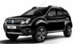
Pearl Black (676)